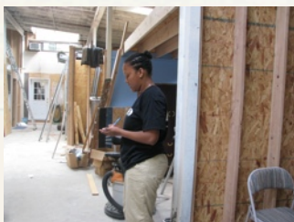
Reconstructing the Community Garden Mural